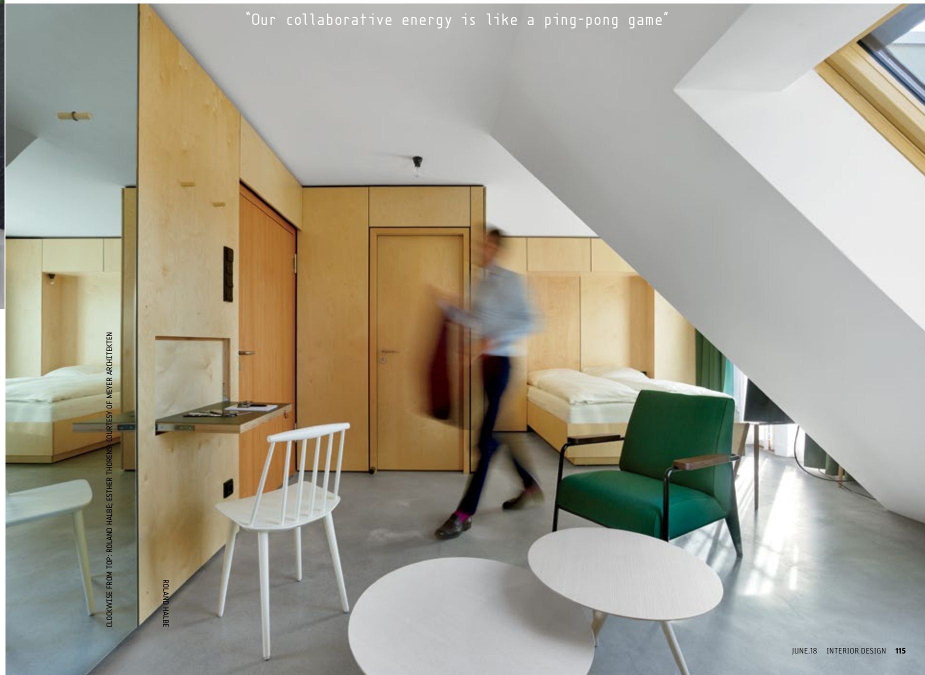
CLOCKWISE FROM TOP: ROLAND HALBE; ESTHER THORENS; COURTESY OF MEYER ARCHITEKTEN

Clockwise from top left: Tinted stucco clads the upper three levels. Aluminum signage is custom. Prefabricated concrete lines the stairwell. Acoustical fabric wall covering decorates the lobby. Birch panels a suite. Michael Meyer and Benjamin Krampulz founded Krampulz Meyer Architekten before launching Meyer Architekten and Fesselet Krampulz Architectes.